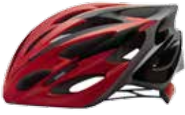
Head Out With a Bike Helmet, New York State Department of Health

You're never too old or too young to attend a bicycle safety course. The more you know, the more you practice the safety you learn, the safer you and your loved ones will be on your bicycles.